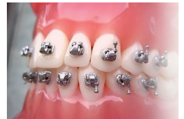
Altitude SL M_29/08/2019